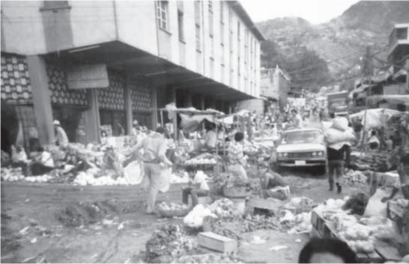
Market wares spilling into the street